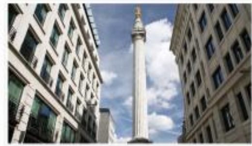
Monument to the Great Fire of London

The Great Fire of London was a significant event in London's history. It began in a bakery on Pudding Lane on Sunday 2nd September 1666. Many buildings were destroyed, including St Paul's Cathedral. Today, a monument stands near the place where the fire began.