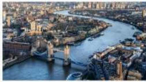
City of London

A city is a large urban settlement where lots of people live and work. There are many shops, restaurants, museums and theatres.