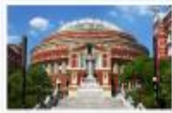
Royal Albert Hall