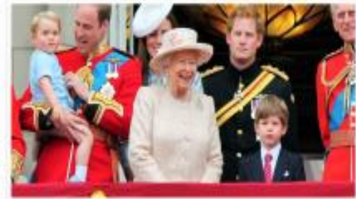
HM Queen Elizabeth II

Queen Elizabeth II is the current monarch of the United Kingdom. She was born in 1926 and became queen in 1952. The Queen is famous across the world.