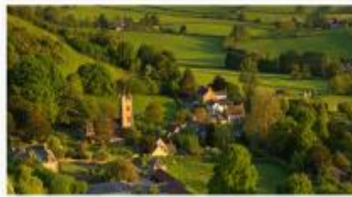
Village of Corton Denham, Somerset

The countryside is a rural area outside of a town or city. Less people live and work in the countryside than in a city.